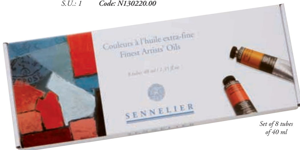
Set of 8 tubes of 40 ml