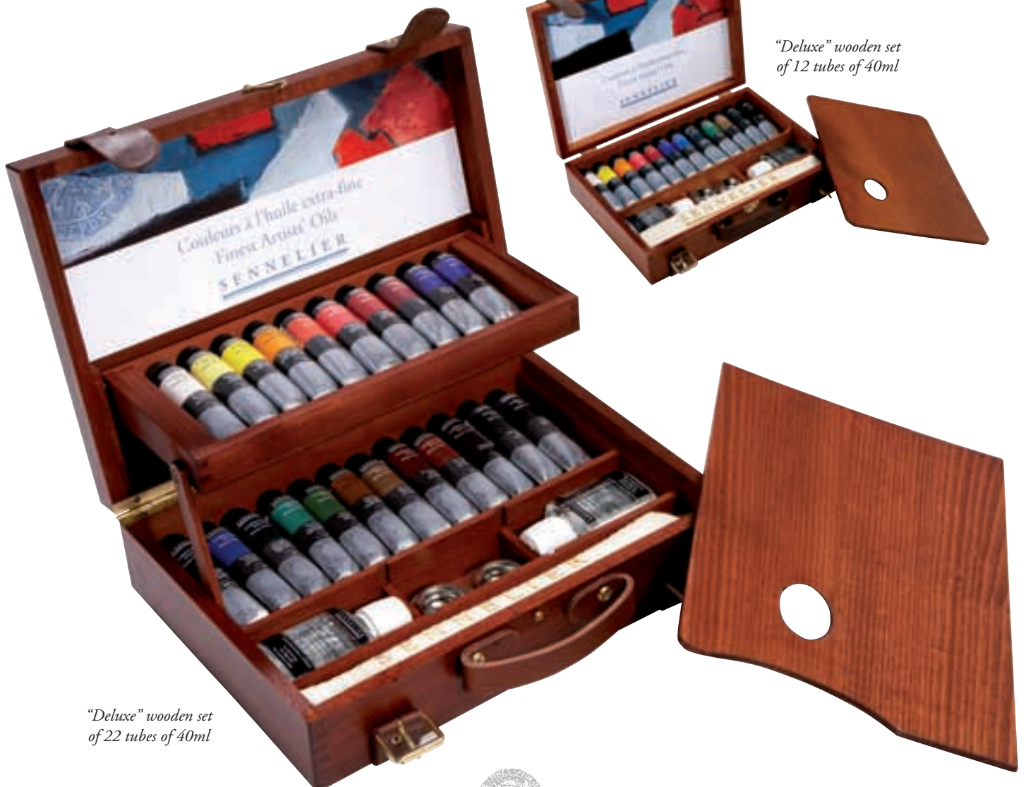
“Deluxe” wooden set of 15 tubes of 21ml

Varnished wooden set with handle and leather straps. Selection of application products, tools and brushes : 12 extra-fine oil tubes of 40 ml, 1 jar of turpentine of 75 ml, 1 gloss varnish of 75 ml, 1 palette, 1 painting knife, 2 brushes 351 n°10 and 350 n°8, charcoals, 1 embroidered “Sennelier” cloth, 1 double metal dipper, 1 printed colour chart. Each S.U.: 1 Code: N130354.00