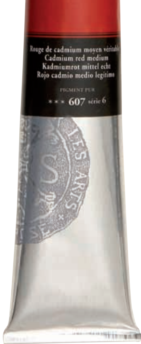
200 ml tube - (6,7 US floz)