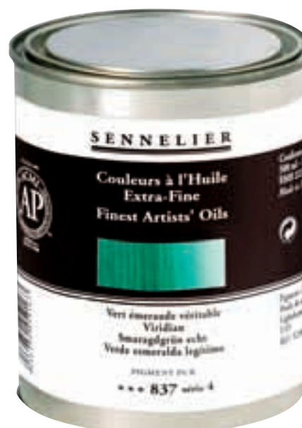
Tin - 500ml