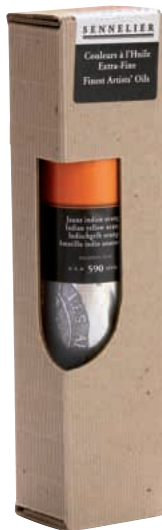
Cardboard box 200ml tube

▲ Colour to be used with care, packaged in a 30 ml glass jar, fitted with a safety cap.