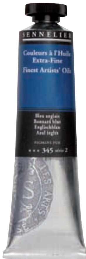
40 ml tube - (1,1 US floz)