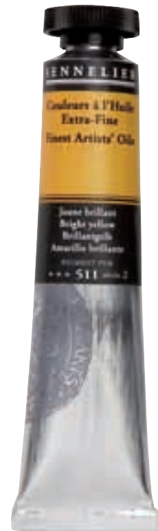
21 ml tube - (0,6 US floz)